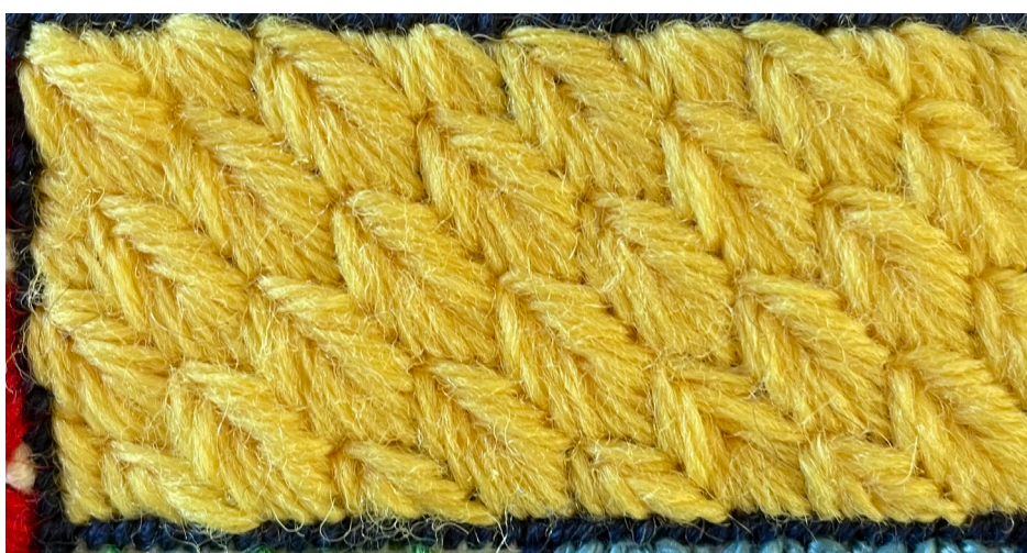
Figure 3 shows the diagonal version - yellow example.

The leaf shape can be made wider or narrower by varying the number of threads the canvas covered by each stitch. I have not shown an example but you can make a star shape by working four stitches radiating into the bottom hole (think points of compass - one tech each stating from N, E, S, and W).